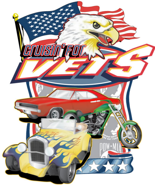
Car Show Location